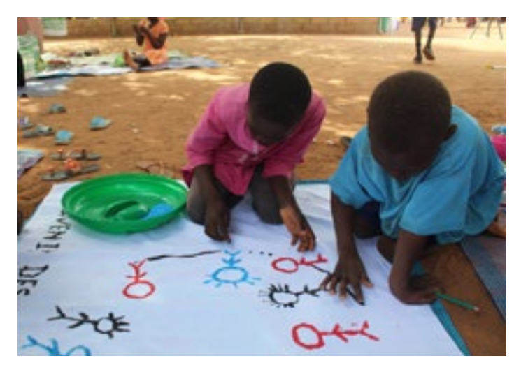
Children engaged in an activity in a child-friendly space supported by Children Believe and UNICEF.

✓ The establishment and animation of child-friendly spaces provides a secure environment and integrated programs (games, recreational and educational activities, healthcare, life skills development, and information on services and supports available to children who experienced trauma due to the security situation). In addition, children play an important and active role in the fight against COVID-19 through the practice of hand washing and other prevention efforts that they pass on to their peers and families.