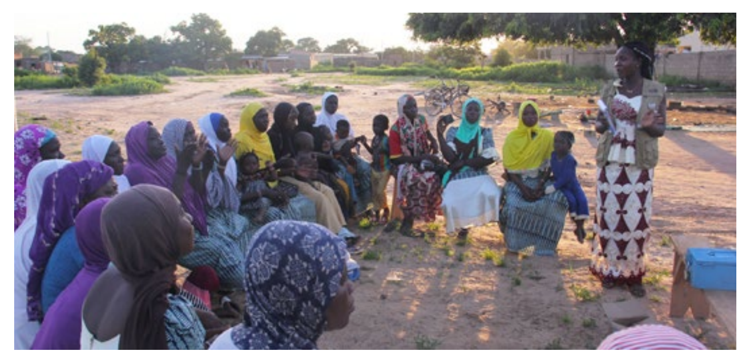
Women from a village savings and loans group supported by Children Believe and UNICEF participate in a training session.

With regard to the geographic locations chosen, these are locations with high security challenges in which the educational and protection needs of children have increased. Indeed, exchanges with the actors and the results of the documentary analysis show that the intervention themes met the priority needs of the populations. Most critically, the results achieved by the project brought about qualitative changes in the lives of the communities, in general, and of girls and boys, in particular.