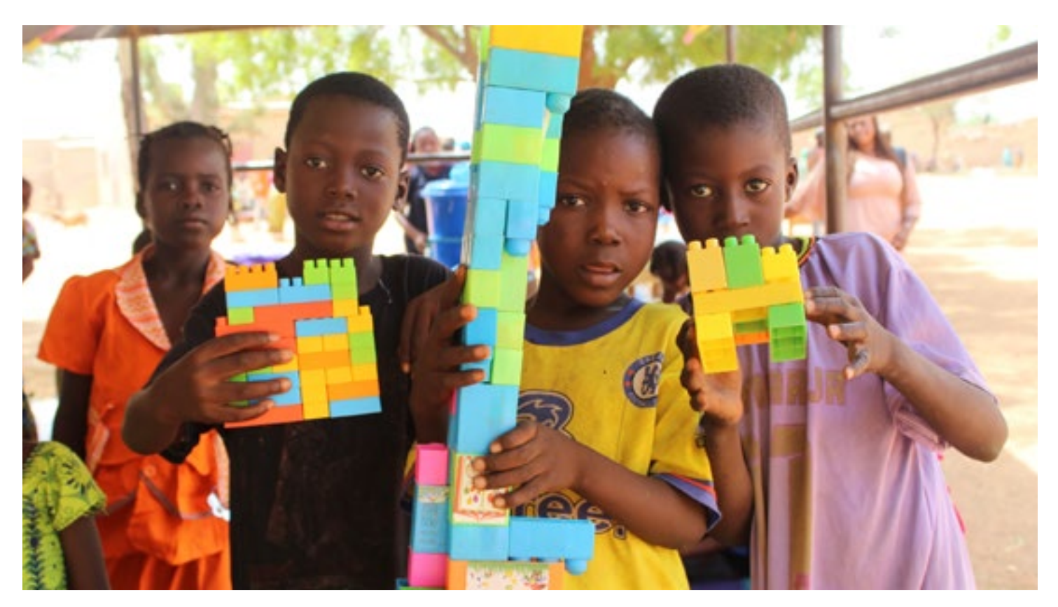
Children with the structures they built in a child-friendly space. The child-friendly spaces provide children with protection and resources to engage in play and support their education.

Fight against COVID-19: Children Believe with UNICEF provided internally displaced populations with hygiene kits. The kits included face masks, sanitizer and soap. Education on protection measures was also provided for 7,303 parents and 40,230 children aged 5 to 17.